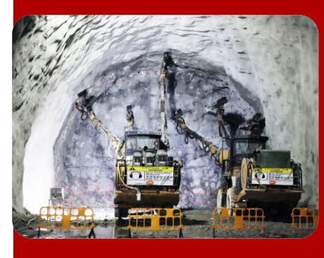
Drilling blast holes on blasting face