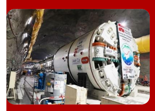
Assembly of TBM inside the Tunnel