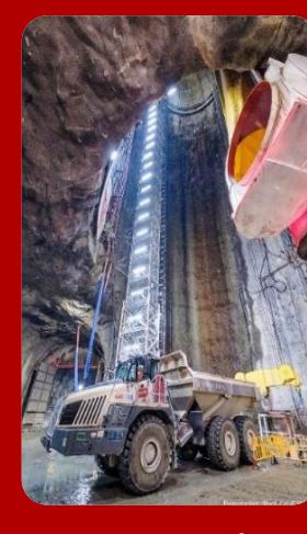
Ho Man Tin Vertical Shaft