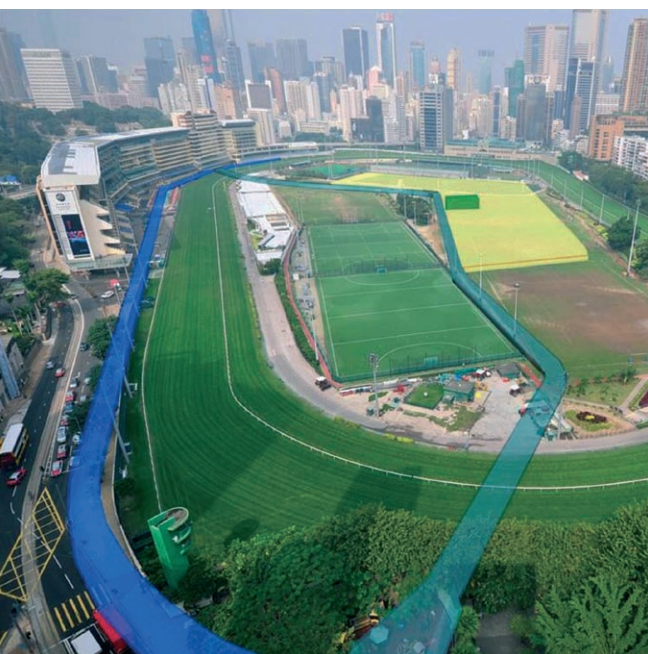
NEC Project – Happy Valley Underground Stormwater scheme

'The main benefit of NEC3 contracts over conventional contracts is that they have partnering built in, encouraging the two contracting parties to work together to solve problems...Overall it is NEC's collaborative spirit that helps to improve contract management, increase cost-effectiveness and improve project outcomes.'